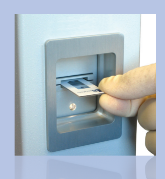
Insert Disposable Slide